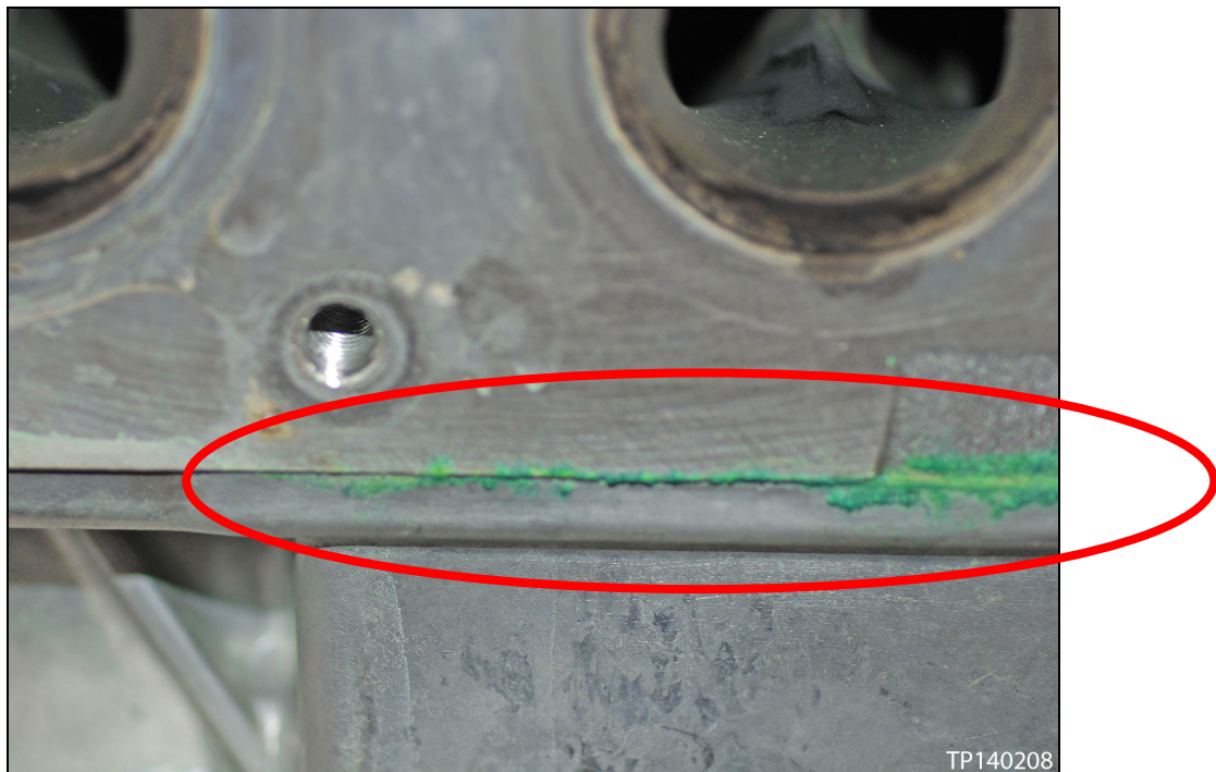
Head gasket area