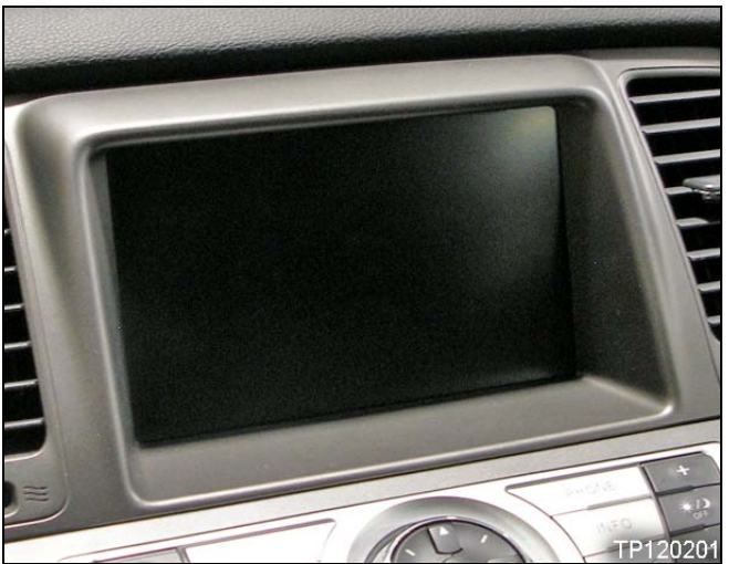
Display completely blank in DRIVE and Reverse

NOTE: If the incident occurs only in REVERSE, further diagnosis may be required.