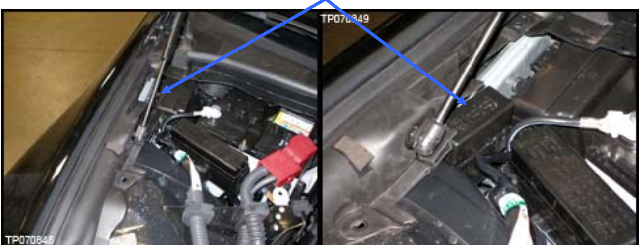
Figure 5 Figure 6